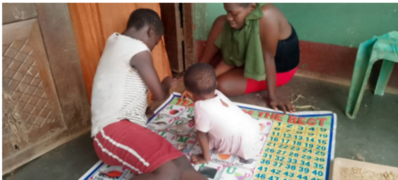
Using a poster as a playmat - parents are able to engage in play-based learning with their children