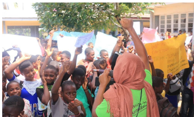
Our team members visit schools to raise awareness and children blow whistles to make as much 'noise' as possible to attract attention to this important message

The Play challenge asked participants to invent or create games and toys with local materials to promote play-based learning. The Nicky's Foundation team took up this challenge and participated in tutorials to learn how to use materials and equipment available locally to promote play-based learning in family homes.