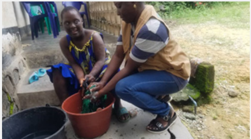
Nicky's Foundation team member working in the community promoting independence

We would welcome feedback from our readers on ways we can improve the newsletter and if you are planning to hold or have held a fundraising event on behalf of Nicky's Foundation and would like us to share it here, then please get in touch.