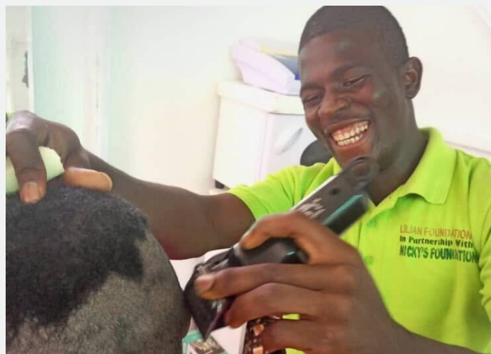
Trainee enjoying learning the art of becoming a barber as part of his apprenticeship

Other opportunities are available such as classes in basic literacy and numeracy as many young people have missed years of school/education.