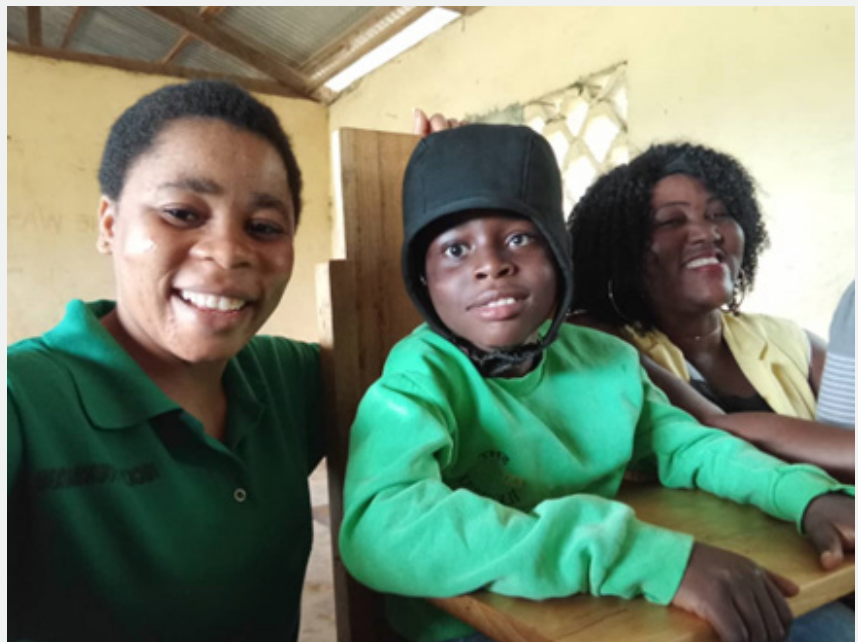
Nicky's Foundation team member and a primary school teacher supporting a child as part of the Inclusive Education Project, please read more below.

We would welcome feedback from our readers on ways we can improve the newsletter and if you are planning to hold or have held a fundraising event on behalf of Nicky's Foundation and would like us to share it here then please get in touch.