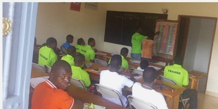
Trainees in the classroom

These fundamental skills are building blocks to developing skills in entrepreneurship and business skills.